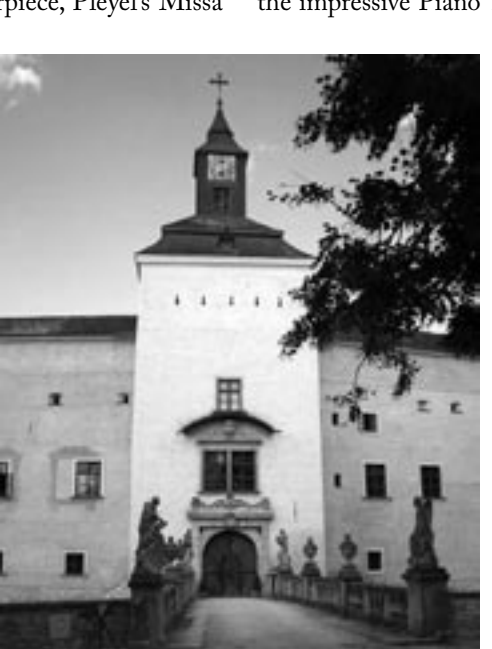
Schloß Niederleis, Austria

IPG and Artaria Editions—must rank among the most interesting of 2007. Although Pleyel composed in virtually every genre, it was his chamber music that enjoyed the greatest vogue. His numerous trios, quartets, and quintets were the staple of amateur perform-