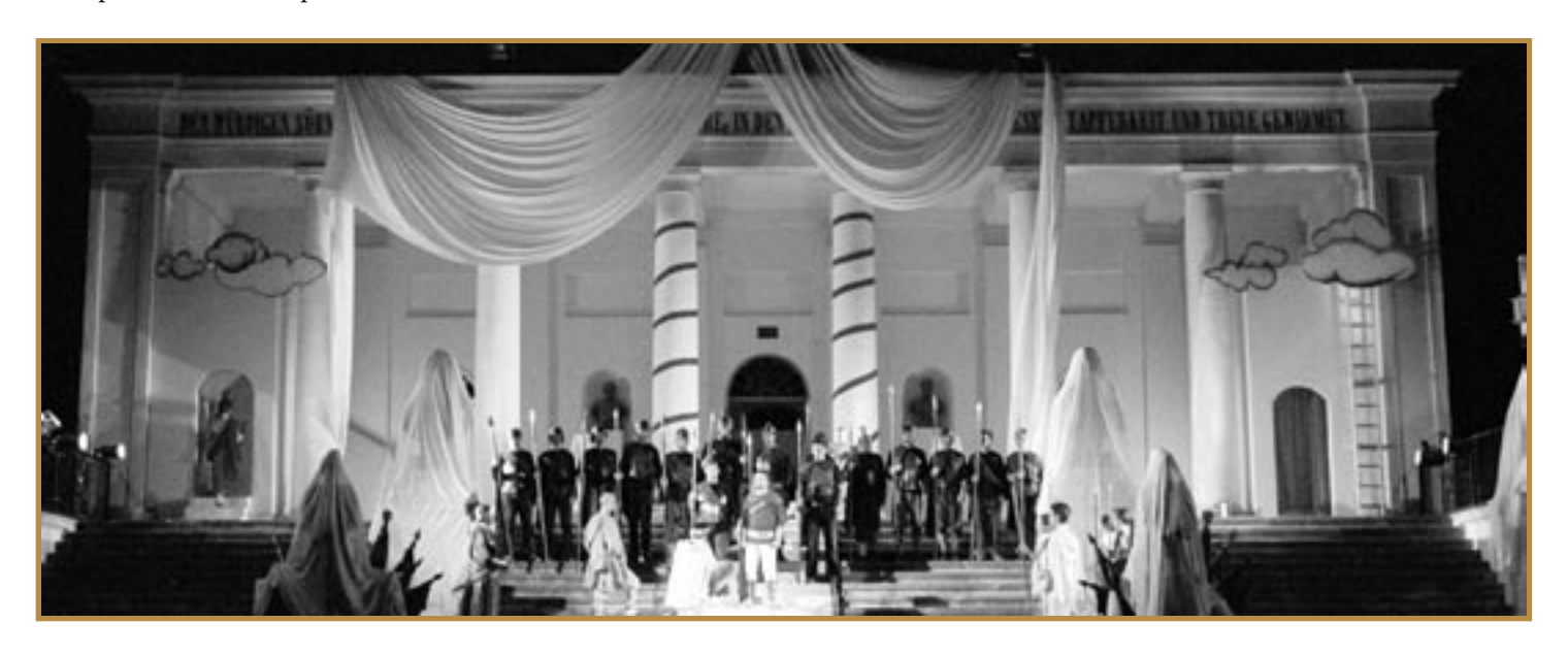
Premiere of Pleyel's opera Ifigenia in Aulide, Heldenberg, Austria, 5 August 2005