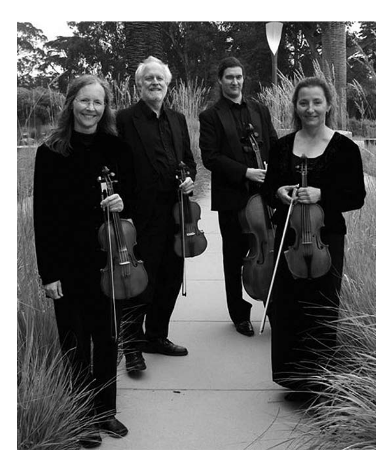
The New Esterházy Quartet