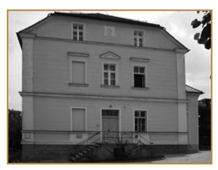
Unitätsarchiv der Evangelischen Brüder-Unität

Understanding this now forgotten oral tradition will elucidate music's integral function in maintaining the values of eighteenthcentury religious utopian communities such as Herrnhut. Reconstructing the Singstunde tradition will also provide new insights into the role of improvisation and the techniques of the ars memo riae in an eighteenth-century written culture.