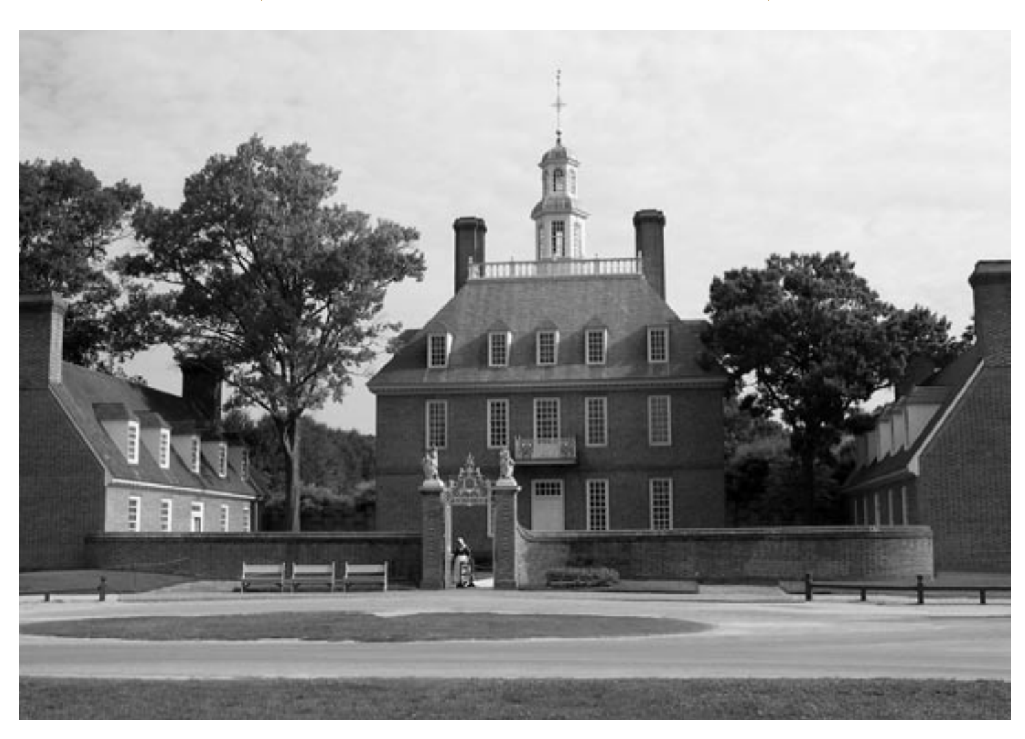
The Governor's Mansion, one of many historic buildings in Colonial Williamsburg—site of SECM's second biennial conference in April